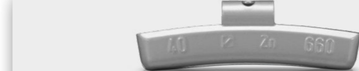
TYPE 660 Original part of: OPEL Weight sizes 5 – 60g