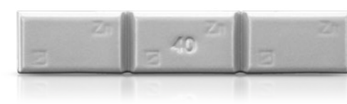
TYPE 390 Original part of: BMW, MINI Weight sizes 5 – 60g