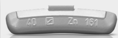
TYPE 161 Original part of: TOYOTA Weight sizes 5 – 60g