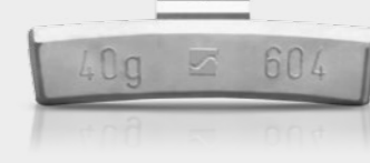
TYPE 604 Weight sizes 5 – 60g