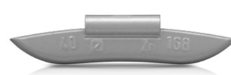
TYPE 168 Original part of: OPEL Weight sizes 5 – 60g