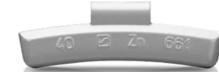
TYPE 661 Weight sizes 5 – 60g