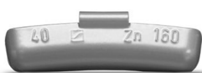
TYPE 160 Original part of: FORD Weight sizes 5 – 60g