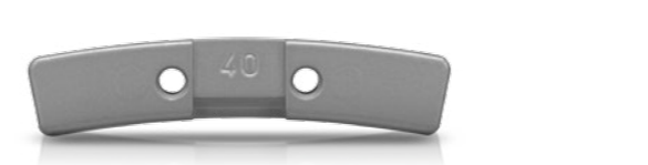
TYPE 280 Original part of: VW COMMERCIAL VEHICLES, VOLVO Weight sizes 5 – 60g Separate clips V3-Zn/B3