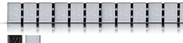
TYPE 380 Weight size 60g