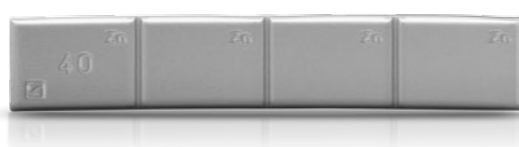
TYPE 361 Original part of: PORSCHE, VOLKSWAGEN, VOLVO, FORD, OPEL Weight sizes 5 – 60g