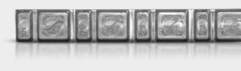
TYPE 303 Weight size 60g