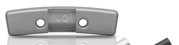
TYPE 261 Original part of: MERCEDES-BENZ Weight sizes 5 – 60g Separate clips M1-Zn/MA-Zn