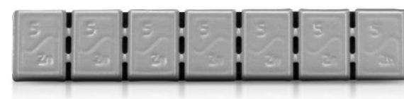
TYPE 365 Weight size 35g