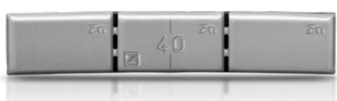
TYPE 360 Original part of: AUDI, MERCEDES-BENZ, CHRYSLER, LAND ROVER Weight sizes 5 – 75g