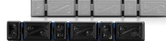
TYPE 363 Original part of: KTM Weight size 45g