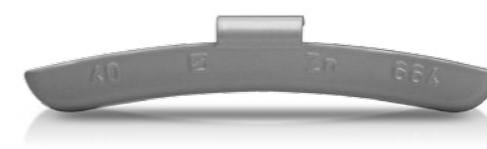
TYPE 664 Weight sizes 5 – 60g