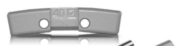
TYPE 274 Original part of: BMW, MINI Weight sizes 5 – 60g Separate clips B1/B3