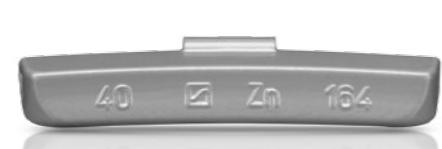
TYPE 164 Original part of: MERCEDES-BENZ Sprinter Weight sizes 5 – 90g