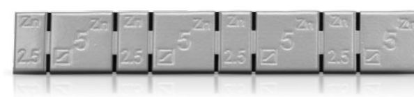
TYPE 369 Weight size 30g