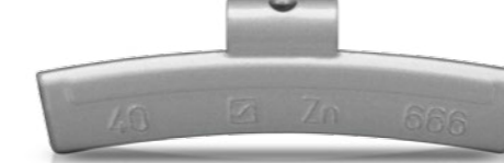
TYPE 666 Original part of: FORD Weight sizes 5 – 60g