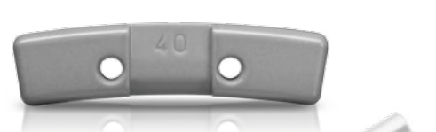
TYPE 260 Original part of: VOLKSWAGEN Weight sizes 5 – 60g Separate clip V3-Zn