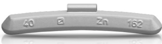
TYPE 162 Weight sizes 5 – 60g