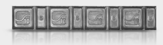
TYPE 330 Weight size 60g