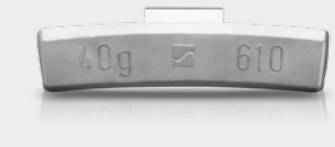
TYPE 610 Weight sizes 5 – 60g