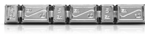
TYPE 367 Weight size 45g