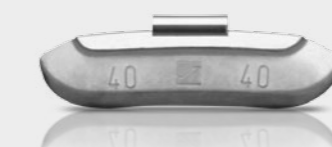
TYPE 101 Weight sizes 5 – 90g

Note: These weights do NOT comply with the EU end-of-life vehicles Directive 2000/53/EC and therefore, according to the EU Directive, must not be applied to M1 and N1 class vehicles.